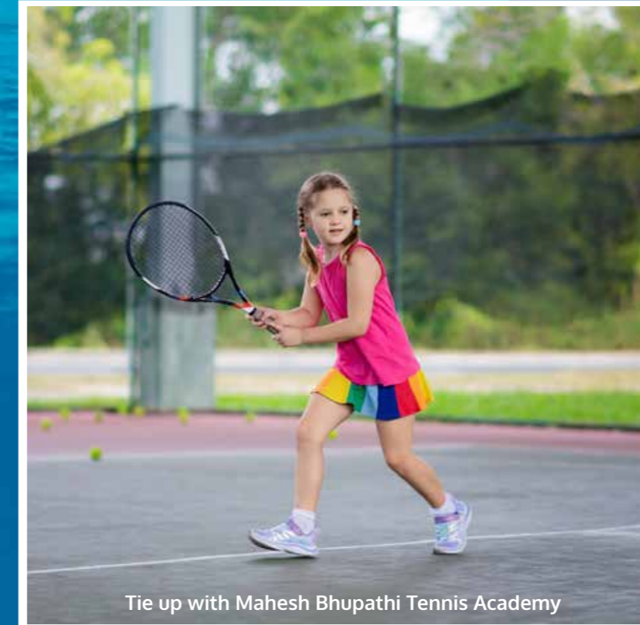
Tie up with Mahesh Bhupathi Tennis Academy